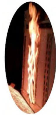
FIGURE 1 – Wall flame bench scale

The risk of wildfires is particularly high in the Nouvelle-Aquitaine region of France. In recent years, several large-scale fires, such as the Landiras fires of 2022, have underscored the severity of this issue. These fires have significant environmental consequences, including the increasing vulnerability of buildings due to the expansion of forest-residential interface zones. Data indicate that 80% of fires originate within 50 meters of homes, highlighting the critical nature of building vulnerability in wildfire-prone areas. Two key factors contribute to this increasing vulnerability : climate change, which expands fire-prone areas, and urban development, which leads to clustered or scattered housing and urban sprawl. These factors complicate fire suppression efforts.