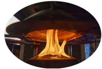
FIGURE 3 – Cone calorimeter