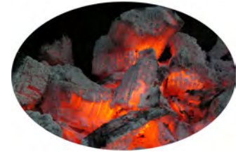
FIGURE 1 – Smouldering process

The risk of wildfires is particularly high in the Nouvelle-Aquitaine region of France. In recent years, several large-scale fires, such as the Landiras fires of 2022, have underscored the severity of this issue. Due to the geological specifics of certain areas in the Nouvelle-Aquitaine region, characterized by the presence of peat and lignite, a new type of fire propagation has been observed : " the zombie fires " – Fig.2.